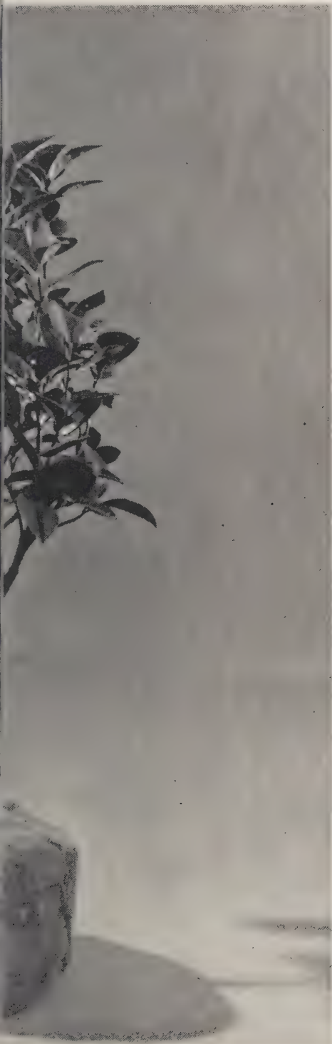
12-18 inch, Branched Camellia B&B

Bella Romana Caldwell Cameo Pink Caprice Cardinal Richielieu Concordia